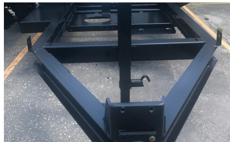
I BEAM TRAILER. Units are built from start to finish at our factory, including the trailer which consists of a sturdy I beam construction.