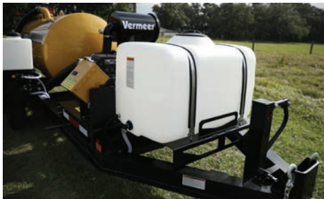
WATER TANK (OPTIONAL). 100 gal water tank with 3.5 gpm (13.2 l/min) @ 2,500 psi.