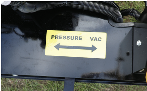
REVERSE PRESSURE (OPTIONAL). Reverse pressure to offload liquids and dislodge debris in hose.