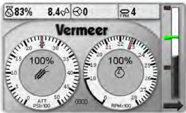
CLEANER DASH DISPLAY. Shows the operator the status of the most critical elements of machine performance.

SMARTTEC PERFORMANCE SOFTWARE helps maximize machine performance by assisting operators with adjustments to machine controls, and monitoring and recording machine performance for future analysis by the machine owner or fleet manager.