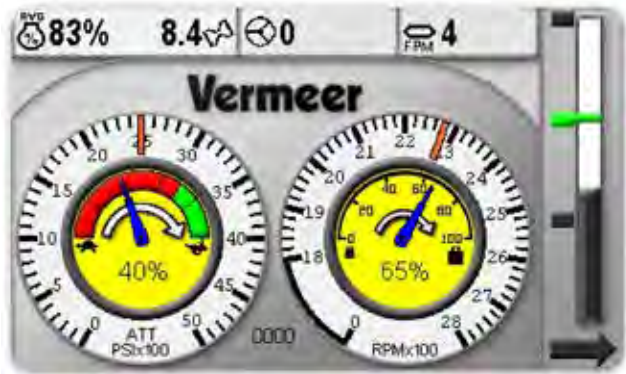
OPTIMIZE PERFORMANCE. Yellow operator prompts provide visual cues to the operator for recommended control adjustment.