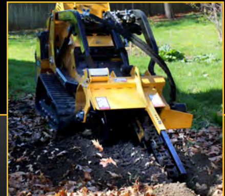
IRRIGATION AND UTILITY INSTALLATION