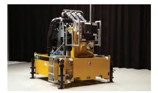
CLEANING CAPACITY TO FOOTPRINT. Manage your fluids with a reclaimer fit for the job. With a 102 in (260 cm) length and 85 in (216 cm) width, easily transport the reclaimer and also achieve the cleaning capacity you need for the job.