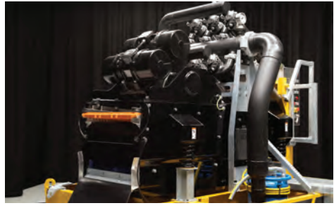
CONTINUOUS PERFORMANCE. The robust design of the shaker deck delivers stable performance under variable processing volume. A high capacity 15-hp (11-kW) pump is used for optimal circulation.