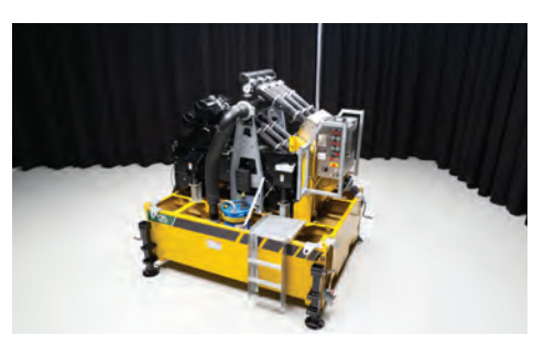
DURABILITY AND WEAR RESISTANCE. The use of high-quality, wear-resistant components maximizes the durability and life of the reclaimer. The lower deck screens are more wear resistant with a polyeurothane coating and the hydrocyclones are 4-in (10-cm) in diameter to optimize performance.