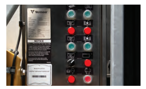
AUTOMATED OPERATION. There's no need to manually control the fluid level. The fluid level switches in the reclaimer tank and the remote level switch in the mixing tank help prevent overflow throughout the fluid system setup and help reduce labor.