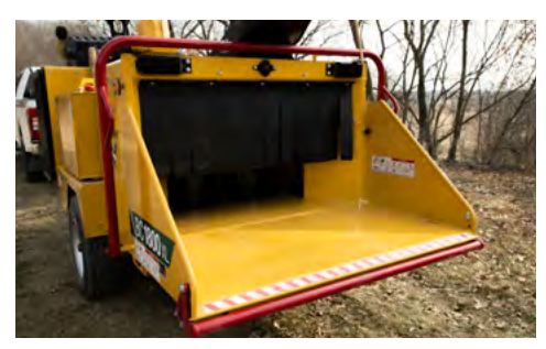
OPERATOR SAFETY. Mounted over the feed table. the four-position upper feed control bar enables the operator to stop the feed rollers and select forward or reverse. The patented bottom feed stop bar is strategically located to make it possible for an operator's leg to strike the bar and shut off the feed mechanism.