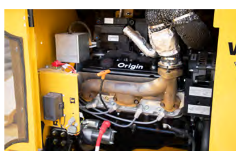
172-HP INDUSTRIAL GAS ENGINE. The BC1800xL is designed with a 172-hp (128-kw) Origin 6.2 L gas engine, powerful enough to tackle jobsite challenges when chipping large diameter wood.